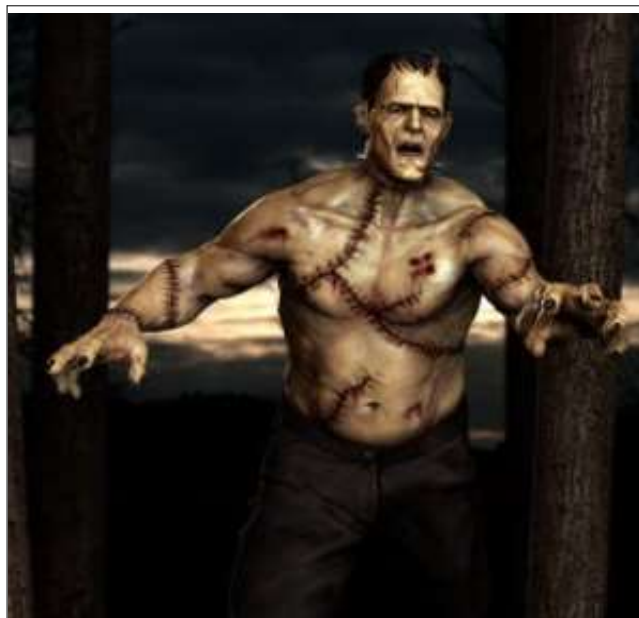
The regional in Nashua in 2018 was the first to feature two Monster Knockouts.